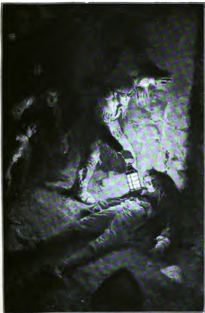
“ GREATHOUSE, ’ WHISPERED MOUNT ”